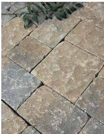
Town N' Country™ - Vineyard Blend