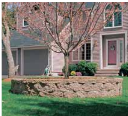
Stonewall™ - Rustic Brown