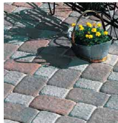
Yankee Cobble™ - Quarry & Beacon Hill Blends

For the name of our Authorized Dealer in your area, call us at 1-800-24-IDEAL or visit our website at www.IdealConcreteBlock.com .